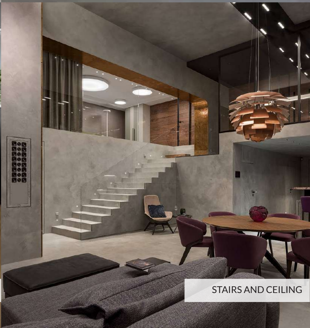
STAIRS AND CEILING