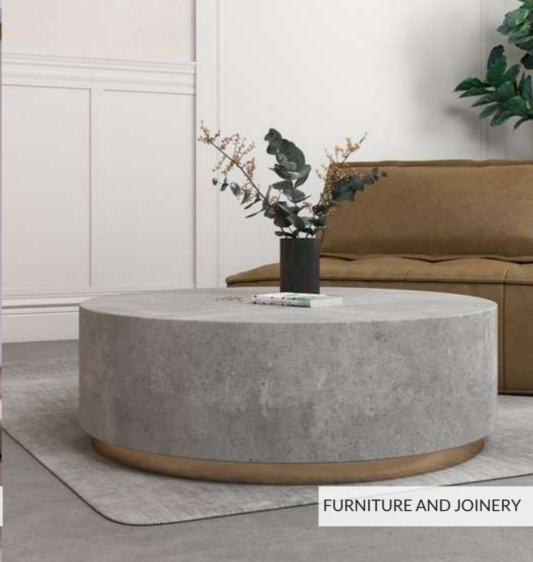
FURNITURE AND JOINERY